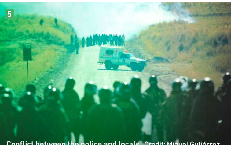
Conflict between the police and locals

Contrary to what Glencore Xstrata claims in its corporate social responsibility reports, such behaviour shows that it has little regard for the human rights of