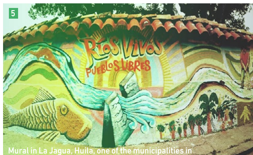
El Quimbo's path of destruction

proportions. 8,500 hectares had been reclassified overnight for so-called "public utility"<sup>21</sup>, effectively dismantling residents' rights and opening up vast expanses of protected Amazonian reserve, river networks and farmlands to industrial "development".