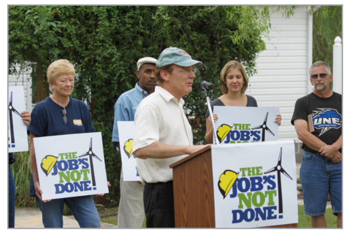
Green jobs was a key rallying point for No on 23 campaigners.

<u>Texas oil companies</u>, the impact on air pollution, and the <u>dismantling of 'green jobs'</u>.