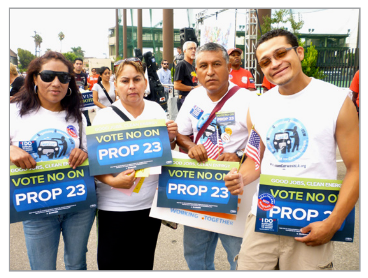
Latino activists around the state rallied against Proposition 23.

and African-American communities in ten target counties – and their strategy was clear as well. The first step was to reach those voters directly, in their language of choice and by leaders and groups they trusted. The second was to make the connection for those voters between Proposition 23 and the threat it posed to their local environmental concerns.