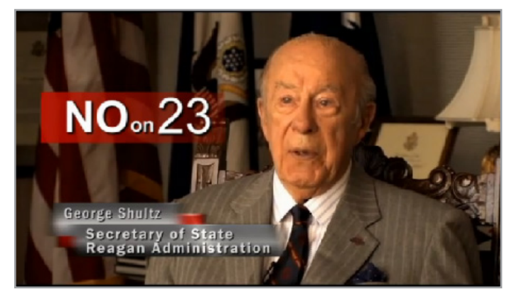
Former Reagan Secretary of State George Shultz, a senior Republican, in a television ad opposiing Proposition 23.

A spot featuring former Reagan Secretary of State George Shultz boasted the bipartisan opposition to Proposition 23, with Shultz saying on screen: "NO on 23' transcends party divisions and is important to all of Californians, and for that matter, the United States and the world." Another ad just juxtaposed a long list of 'NO on 23' endorsers, including both the Democratic and Republican candidates for governor, against the words "Two Texas Oil Companies." Another ad raised fears of costs to consumers: "23 could increase energy costs for California families by up to six hundred and fifty dollars per year."